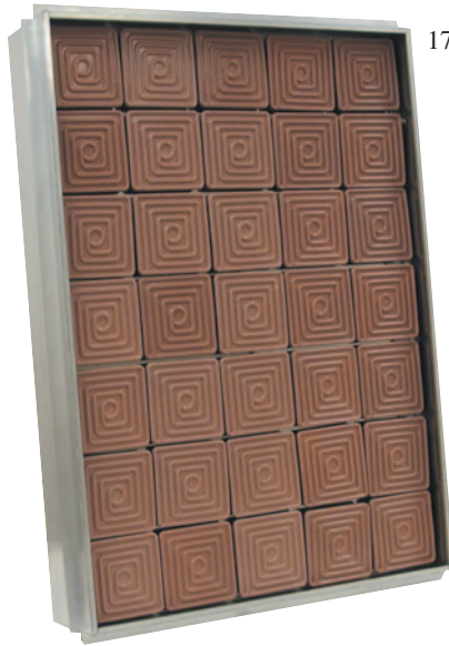
17.5 KW 380V 4-Zone CRH E-Mitters