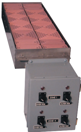
4 Rows CRH E-Mitters 4 Rows CRZ E-Mitters (at ends)