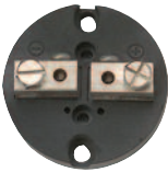
Bakelite 2-Terminal Block P/N: TCA-116-111