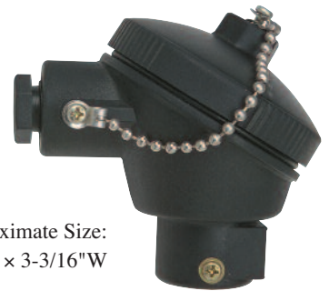
Approximate Size: 3-7/8"H x 4-1/8"L x 3-3/16"W