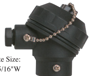
Approximate Size: 2-5/8"H x 3"L x 2-5/16"W