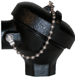
Approximate Size 3-1/2"H x 3-1/2"L x 3-1/2"W