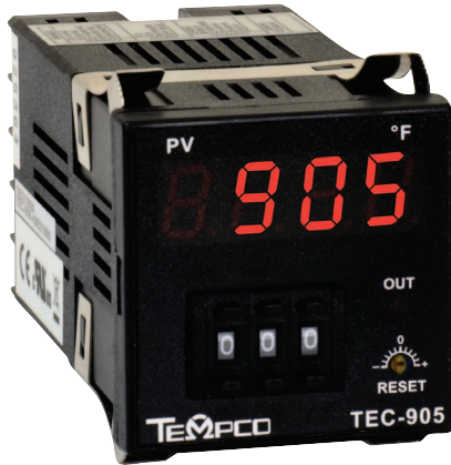
Simple Setpoint and Display!