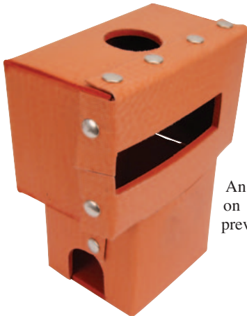
An insulating heater used on a compressor pump to prevent freezing in Siberia.

Round heater with a center hole used in air horns for motorized vehicles such as Trains, Semi Trucks, or RVs where the leads need to go through the center.