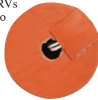
Cone heater used on a soup dispenser kettle.

Round heater with a center hole used in air horns for motorized vehicles such as Trains, Semi Trucks, or RVs where the leads need to go through the center.