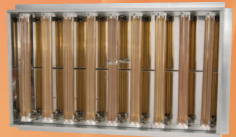
Type ARG Gemini Medium Wave Arrays (page 7-69)