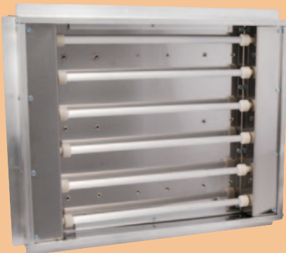
Type ARK Quartz Tube Arrays (page 7-70)