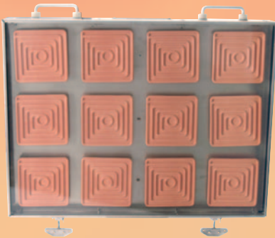
Type ARA Array for Ceramic E-Mitters (page 7-28)