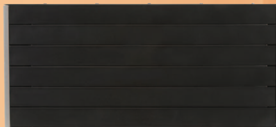
Type ARC Channel Strip Heater Arrays (page 8-10)