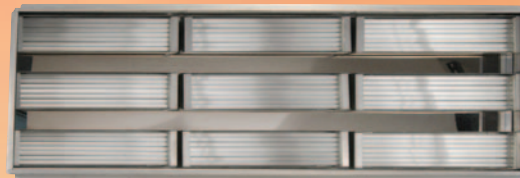
Type ARV Array for KTE & KTG E-Mitters (page 7-48)