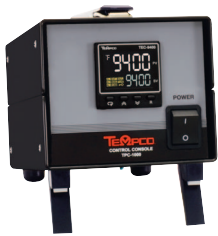
Model TPC-1000 1-Zone Control Console 4-7/8" H x 9" D x 5" W

These 1- to 4- zone units use our reliable next generation TEC-9400 1/16 DIN auto-tuning fuzzy logic PID temperature controllers with user-friendly programming and bright LCD displays using NFPA/IEC standard colors.