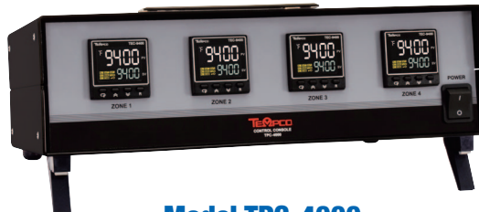
Model TPC-4000 4-Zone Control Console 4-7/8" H x 10" D x 14-13/16" W