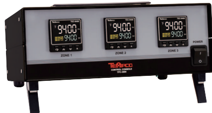
Model TPC-3000 3-Zone Control Console 4-7/8" H x 9" D x 11-1/4" W