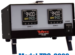
Model TPC-2000 2-Zone Control Console 4-7/8" H x 9" D x 8-1/4" W