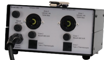
Typical Rear View