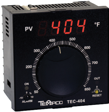
Dial Setpoint and Display