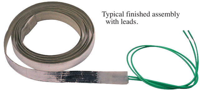
Typical finished assembly with leads.